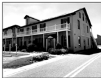
Carriage House Inn 200 S. Seton Ave., 301-447-2366