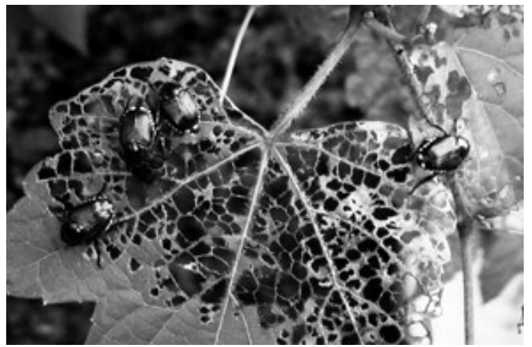
By the time this paper gets into your hands, the scourge that are Japanese Beetles will be back.

You've seen them, the metallic green beetles that show up on in your landscape every July. Later in summer