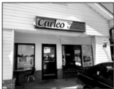
Carleo's Italian Pizza 101 Silo Hill Rd., 301-447-1999

Thank You to All Emmitsburg Restaurants Continue to support your local restaurants! They've helped to keep us safe and well fed during the trying past year!