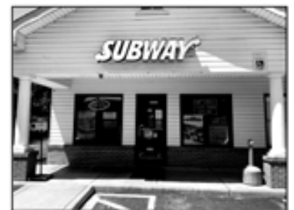
Subway 101 Silo Hill Rd., 301-447-2059

Emmitsburg Business & Professional Assoc. www.emmitsburgbusiness.com