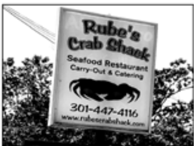
Rube's Crab Shack 17308 N. Seton Ave., 301-447-4116

EBPA Businesses are designated in Italics