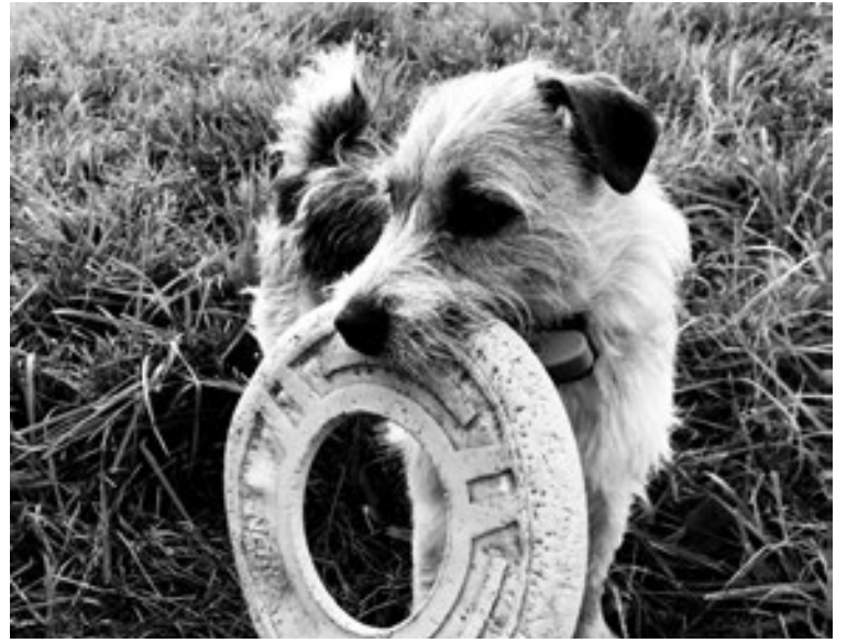
Stupid dog. Like all Jack Russells, Jake needs something to chase, so recently he's taken up chasing birds. Yes, birds! Stupid dog.