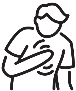
Chest tightness, squeezing, pain, or pressure