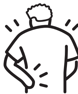
Pain or discomfort in the arms, neck, jaw, back, or stomach