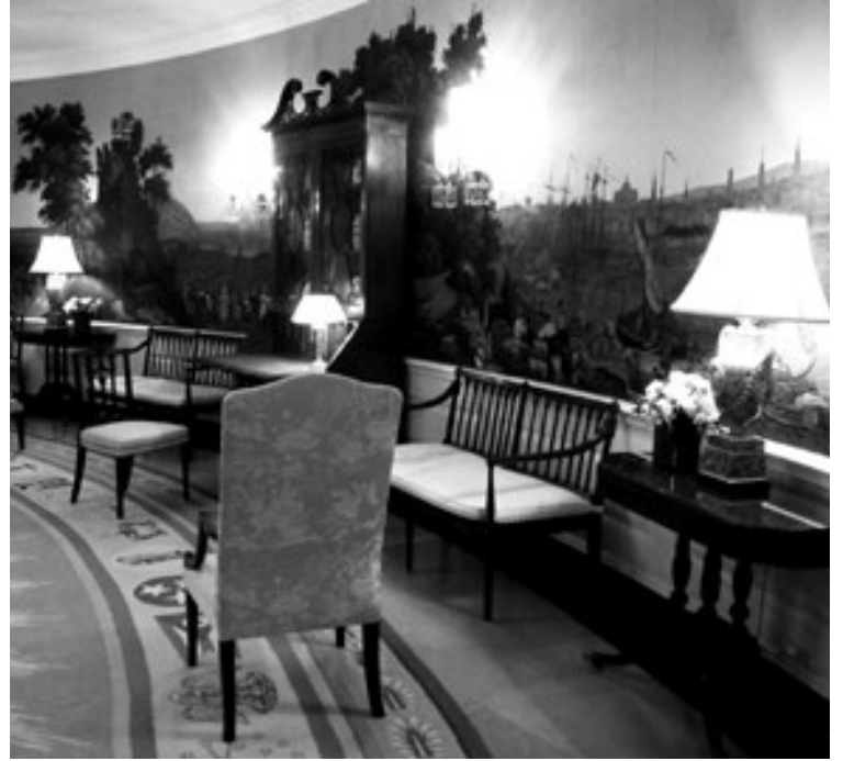
The wallpaper in the 'Diplomacy' reception room in the White House once graced the Stoner property in Thurmont.