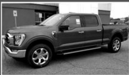
'21 F150 XLT Crew 4x4 3.5 EcoBoost Velocity Blue

Order Your F150 or Super Duty Today Taking Orders on all Models NOW!