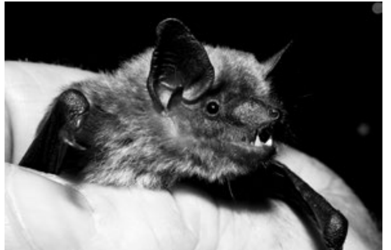
The brown bat ( Myotis lucifugus ) is estimated to eat up to 600 mosquitoes an hour, making any property that hosts one almost mosquito-free!

The Baltimore Oriole The Baltimore Oriole ( Icterus galbula ) is a medium-sized bird,