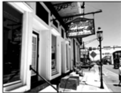
Palms Restaurant 16-20 W. Main St., 301-447-3689