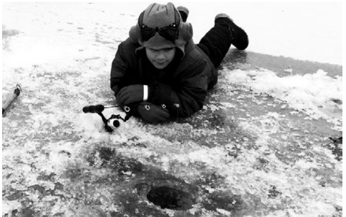
Other than the fact ice is in fact 'hard water', this image has nothing to do with Mike's article, but given the heat, we figured it would be a nice reminder that before you know it, winter will be here.

If you are interested in learning more about local water quality, specifically the water at Mt.