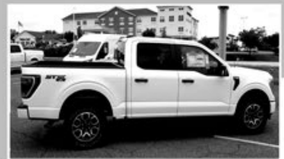
'21 F150 STX Crew 4x4 2.7L EcoBoost