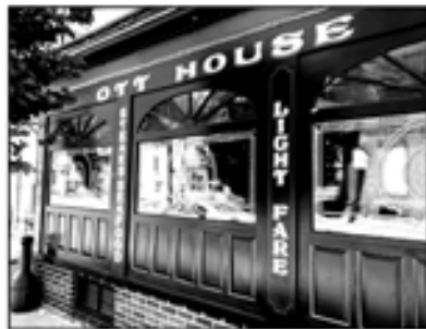
Ott House Pub 5 W. Main St., 301-447-2625