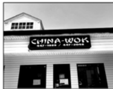
China Wok 101 Silo Hill Rd., 301-447-1889