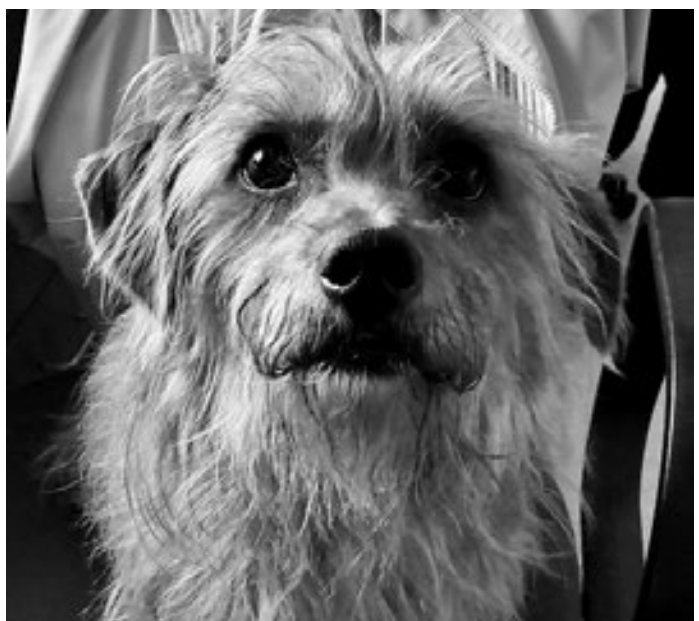
Jasper is a 4-year-old Terrier/Dachshund/Yorkie mix who came into the shelter because his owner could no longer care for him. Look at that cute little face! Jasper is a sweet guy looking for a second chance. Could you give him one?

For more information about Cressida, Rummy, or Jasper call the Cumberland Valley Animal Shelter at 717-263-5791 or visit them online at www.cvaspets.org or better yet, visit them in person at the shelter.