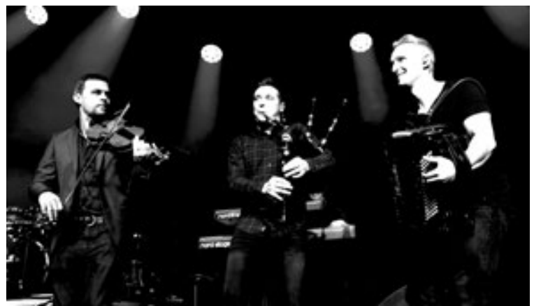
Scottish folk-rockers Skerryvore are set to light up the Majestic Theater stage September 10.

Skerryvore is just the first of several live performances slated at the Majestic this fall, including Tommy Emmanuel, CGP (October 5), Rich Little (October 15)