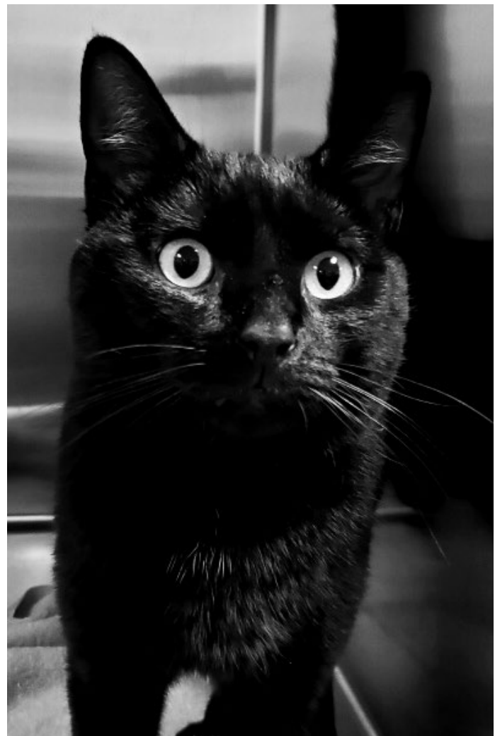
Rummy came into the shelter as a stray, so we don't know a lot about him, but he is one nice cat. He's about 3 years old and really likes taking snoozes in his soft bed. Could Rummy be your new best friend?