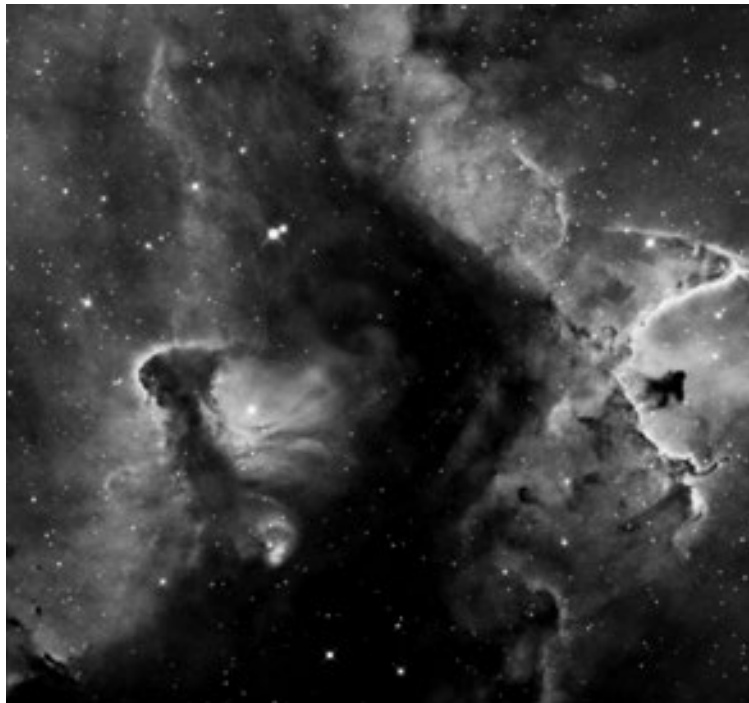
The great rift in the Soul Nebula

Mercury is at greatest western elongation in the dawn sky on July 4th, but disappears into Sun's glare by midmonth. Venus dominates the dusk, and overtakes most, smaller, and much fainter Mars on July 12th, passing only ½ degree (the diameter of the disks of the Sun and Moon to our naked eyes!) on July 12th, the same evening the waxing