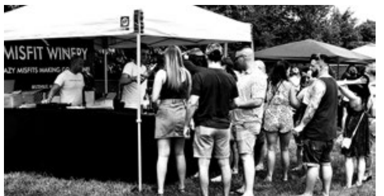
If the attendance at the Taneytown Wine Fest is any indication, summer festivals will be jam-packed.

Fairfield Borough's Pippinfest is back-on-track and will be held on September 25 & 26. Planned events for the 40th anniversary celebration include Saturday yard sales, and featuring music, street entertainment, apple dessert contest, and Cruise-In Car Show and Swap Meet on Sunday. Both days will feature craft and food vendors, quilt show & self-guided walking tours. For additional information visit www.pippinfest.com .