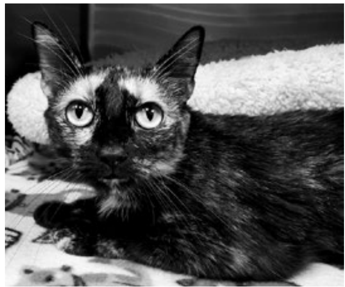
Cressida came into the shelter as a stray and she was very pregnant. We got her into foster care and until she and her babies were ready to find a home. Cressida is a sweet, 3-year-old tortie who is a bit on the shy side and will need someone that understands that she will need some time to adjust to a new environment and may hide until she feels safe. Once she feels confident, Cressida loves attention and enjoys chin scratches. Can you help this mama out?