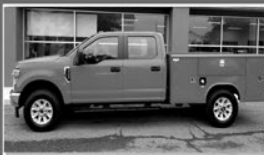
'21 F350 4x4 with Reading Service Body Crew Cab 6.2L Gas or 6.7L Diesel