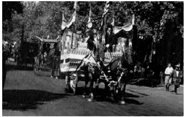
1914 Emmitsburg Memorial Day parade

On Sunday afternoon, Children's Day Services were held at St. Paul's Lutheran Church in Harney. The