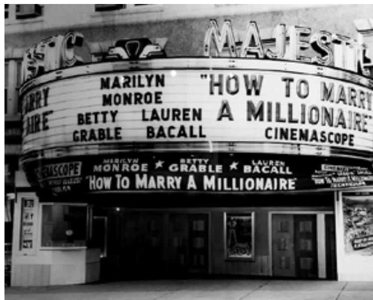
After what seems like a lifetime, the Majestic Theater has finally re-opened - and in doing so - saved the summer!

In preparation for the public's return to the Majestic Theater, a number of policies and procedures have been put in place to help ensure the health of patrons and employees. Masks are required at all times inside the Majestic unless a patron is in their seat, enjoying a treat from the concession stand. Occupancy is initially limited in all spaces, and auditoriums and other public areas will be thoroughly cleaned before and after each show.