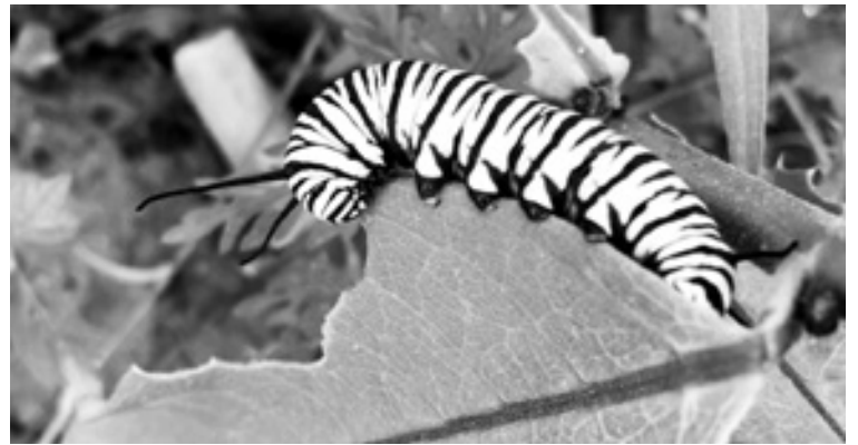
The caterpillar of the monarch butterfly eats only milkweed, a poisonous plant, storing its toxins in its body as a defense against hungry birds.

Some plants are only able to store limited amounts of toxins to defend themselves and deploy them only to areas under attack. In response, insects will feed in groups so that toxins are spread thinly enough to not overwhelm any individual. Animals may ingest poi-