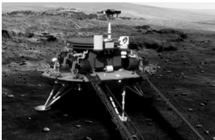
China has successfully landed its rover Zhurong, named after a god of fire in Chinese mythology, on Mars on May 19, just 3 months after NASA's Perseverance Rover land. Both rovers are looking for proof of life on the Red Planet

This June Mercury lies between us and the sun, after putting on a fine show in the western sky last month. But Venus is around to stay, getting