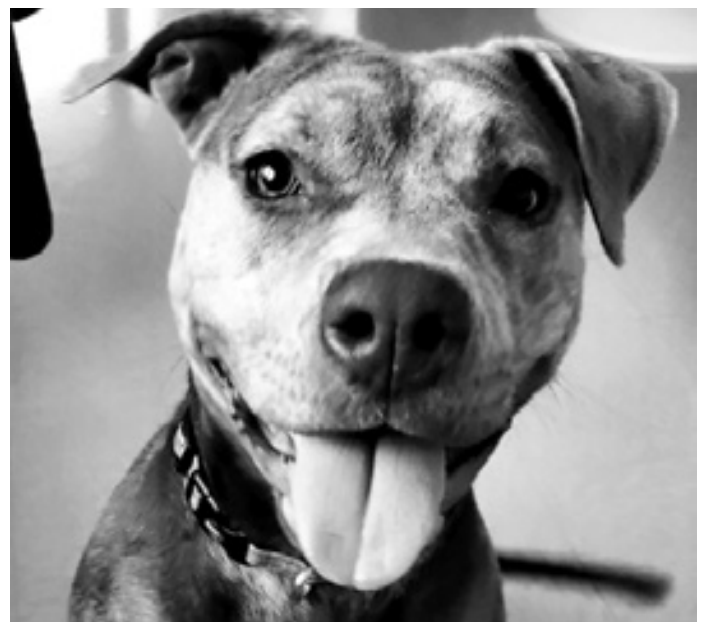
Fiji came into the shelter as a stray and she is one beautiful girl! She's a 1-year-old terrier mix who is basically a gray/blue/silver brindle color. She's quite unique! Fiji loves to sunbathe and play fetch. She has a ton of energy and will need an owner who can be a strong leader, or alpha, if you will, of the pack. Fiji still has a lot of puppy behavior and will need someone that understands the time and the patience that goes into training. She can also be dog selective, so a home without other dogs would be best for her. Because of her high chase drive, she probably should be in a home without cats, too. Because of her energy level, an age restriction for children may apply, so please discuss this with shelter staff. Do you have the right spot for Fiji?

For more information about Pippy, Queenie, or Fiji call the Cumberland Valley Animal Shelter at 717-263-5791 or visit them online at www.cvaspets.org or better yet, visit them in person at the shelter.