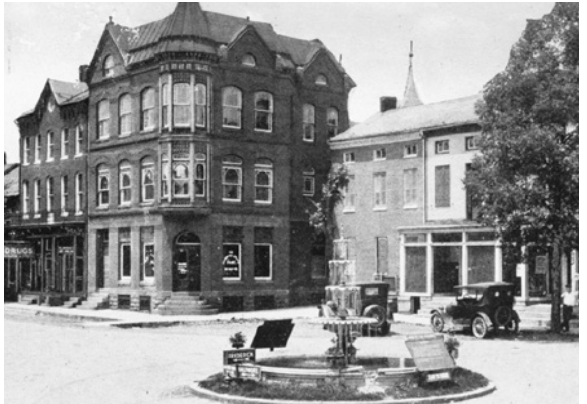
The old Annan-Horner Bank building on the northeast corner of the square in Emmitsburg is a wonderful example of beautiful turn of the century architecture.

Artful architecture does not only influence the mood of an individual. In addition to this personal effect, there is an undeniable communal aspect to classical architecture that can influence a group as a whole. Consider for a moment that the evolution of previous architectural styles reflected the evolution of cultures. Ameri-