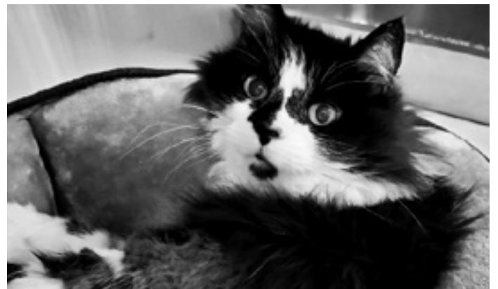
Queenie came into the shelter as a stray in really rough shape. She was emaciated, matted, sick and weak. She got a haircut, fluids, antibiotics and good food. Every day Queenie got stronger and improved. Since she was so weak, bloodwork was sent out and came back that she had a bacterial blood parasite. She has been since treated for it and it has not appeared on follow up bloodwork. However it can recur, so she will need someone that can keep up with regular veterinary care as well as her grooming needs. Despite everything she's been through, Queenie is a sweet, 4-year-old girl who just loves attention. Can you show her what a good life is really all about?