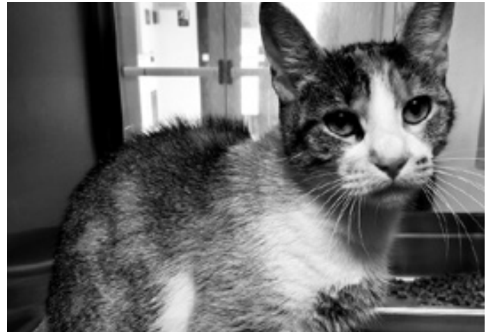
Pippy came into the shelter with her kitten because her owner could no longer care for them. She is a 2-year-old calico and tabby girl who can be selective about other cats. She loves playing with feather toys and is a super sweet girl. Can you give her a second chance?