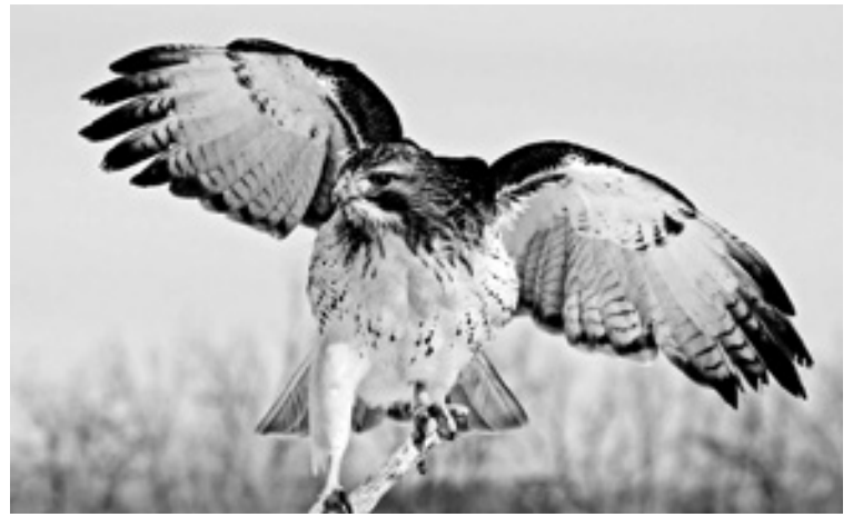
The red-tailed hawk is one of the most common members within the genus of Buteo in North America, and worldwide.

The Red-Shouldered Hawk is a medium-sized hawk in the Buteo family of hawks. It is a bird of the forests. This raptor prefers large forested areas that are associated with bottomlands, wooded streamside areas, and swamps. The hawk prefers older growth forests with an open understory where spotting prey is easy to do. The Red-Shouldered Hawk is found mostly in the east, but there are isolated populations from Oregon down to Mexico