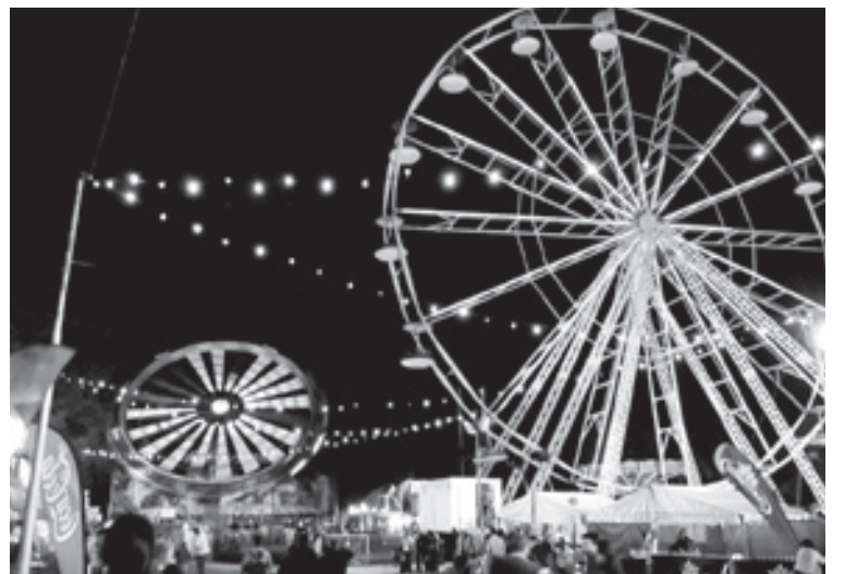
While the drop in COVID cases came too late for some carnivals and fairs, those traditionally taking place in summer have had time to organize and resume.

ertheless taking a chance, because there is no real assurance that the pre-COVID attendance numbers can be achieved.