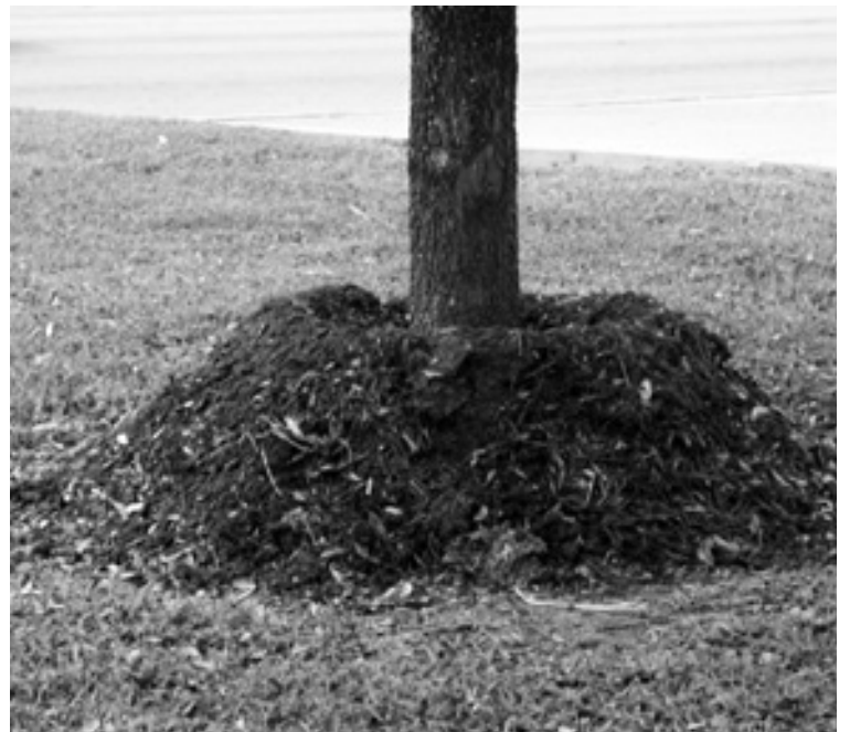
If you're looking to kill your tree, then use mulch like this. In a few years the tree will be dead. If you like your tree however, keep mulch away from the base of the tree.

Plastic sheeting and woven landscape fabric create impermeable and